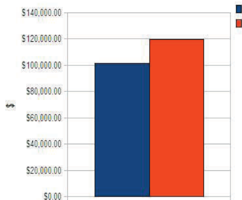
Year to Date: Giving vs. Budget (Through Sept. 5)

I know that we can all look forward to a terrific holiday season ahead, and a strong finish to the current year.